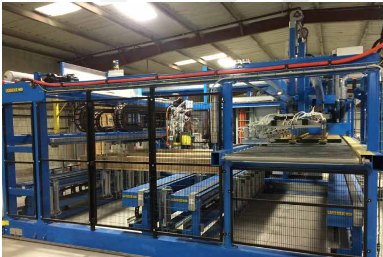
AutoFloor bridge working over jig system: gluing, adding sheets, handling tongue and groove connection, stapling/nailing, sawing, milling and marking using inkjet