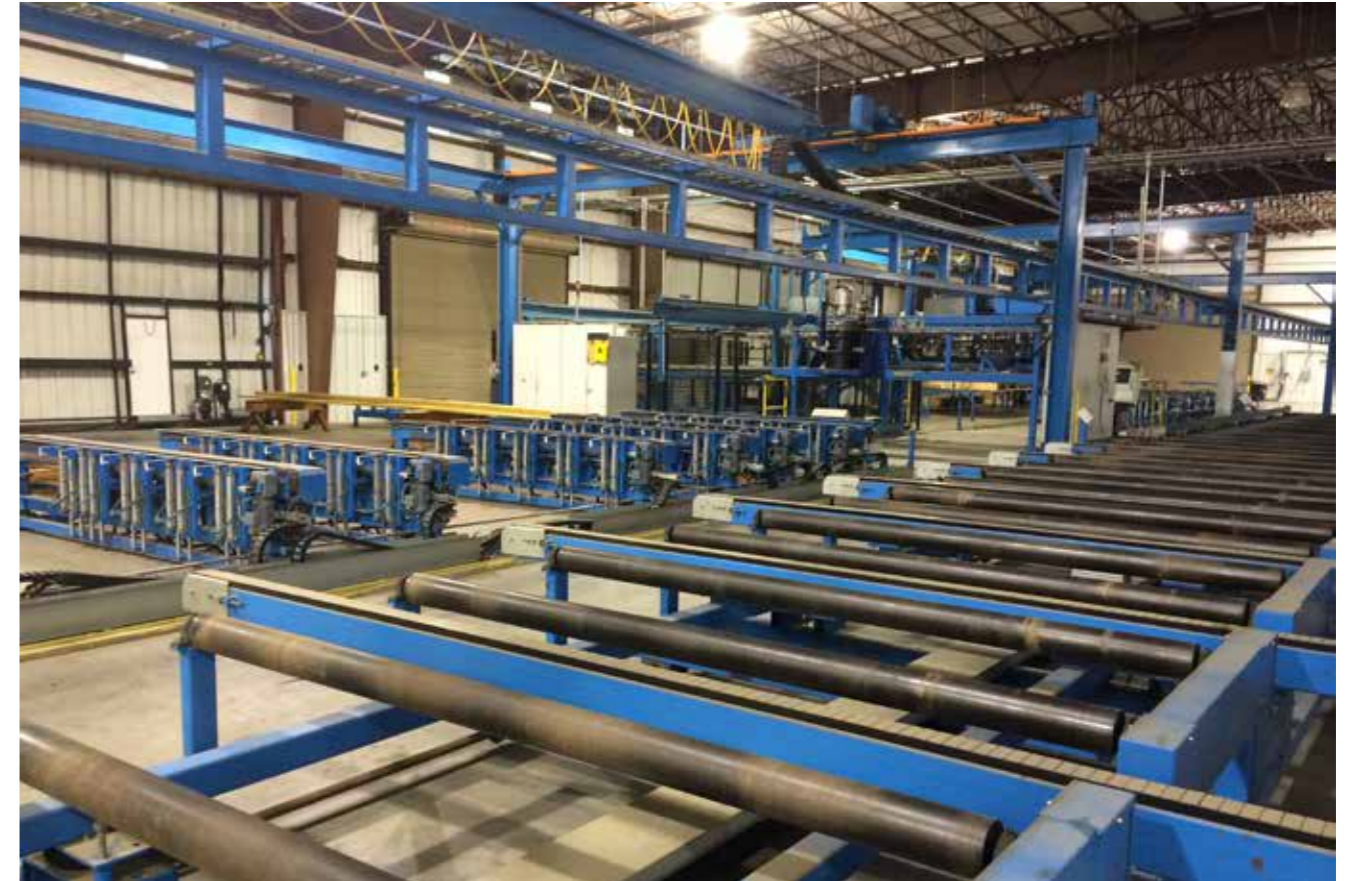
View showing AutoFloor 2 jig solution and side/roller transport system