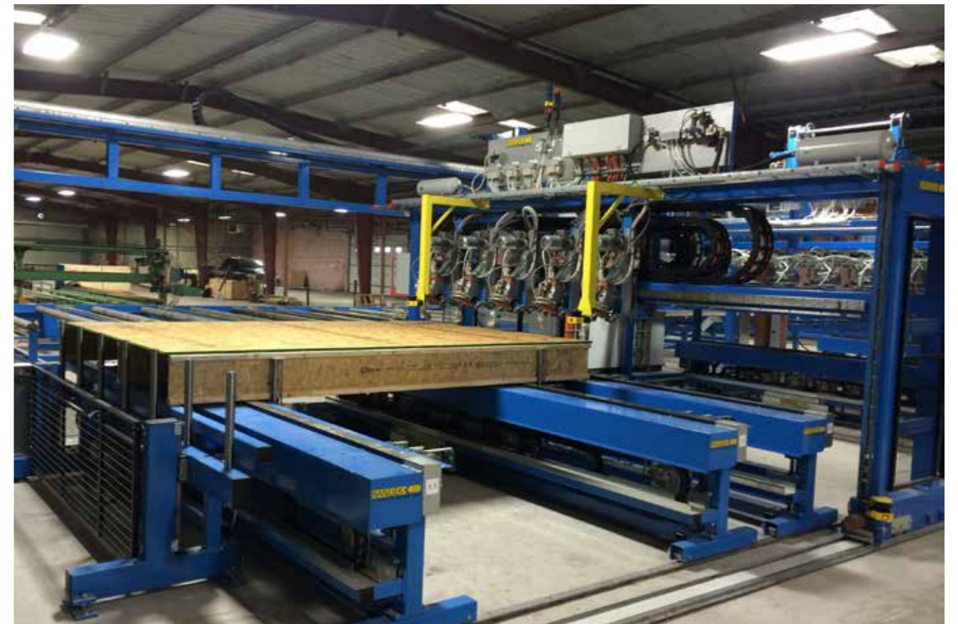
AutoFloor bridge positioned next to AutoFloor jig system