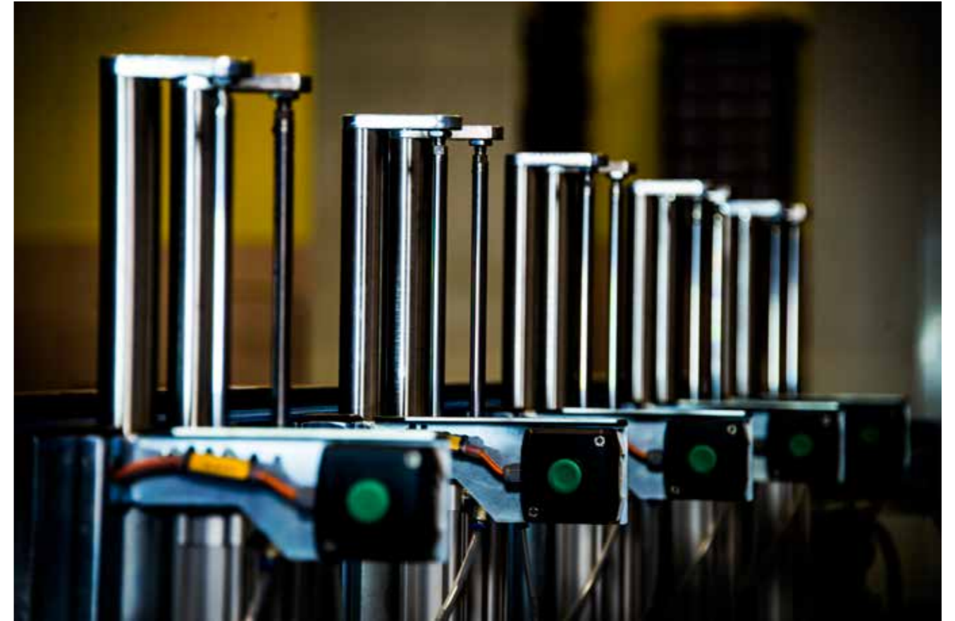
Activated/Upraised AutoFloor pins and button for activation and clamping