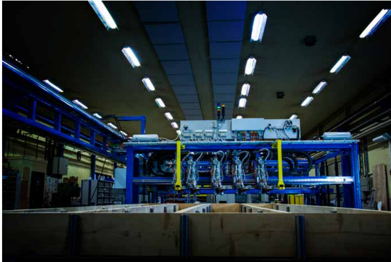
AutoFloor System jig and automatic bridge