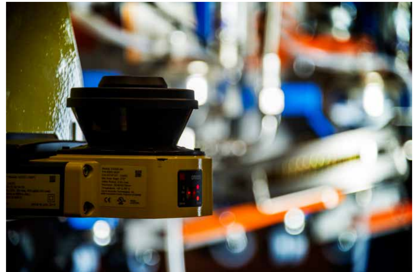
AutoFloor System safety laser