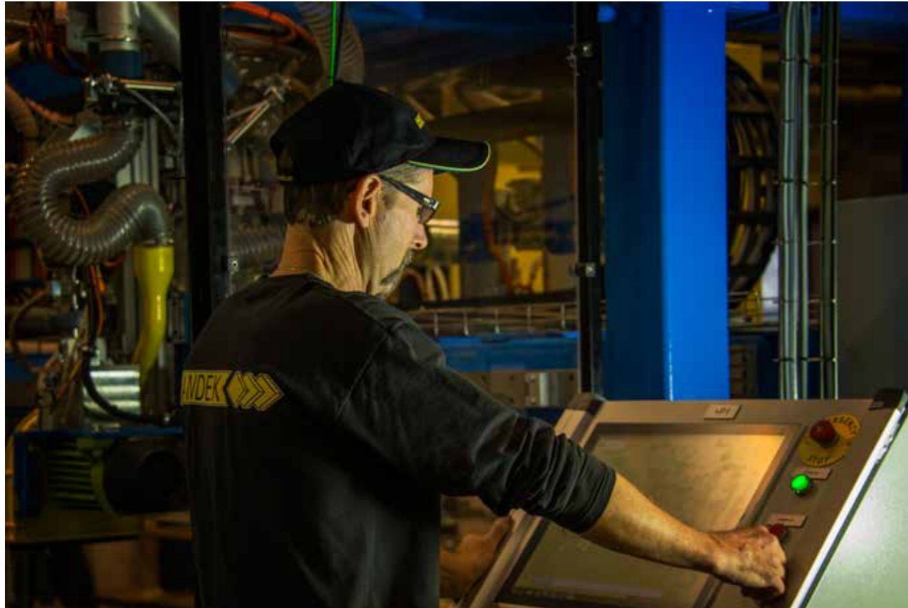
Operator using AutoFloor control system